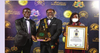
NOGUCHI MEMORIAL INSTITUTE FOR MEDICAL RESEARCH