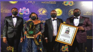
UNIJAY LIMITED (HUMANITARIAN EXCELLENCE)