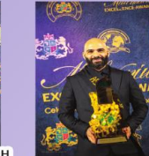
TWELIUM INDUSTRIAL (EXCELLENCE IN CORPORATE SOCIAL RESPONSIBILITY)