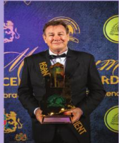
GEODRILL (EXCELLENCE IN MINING & EXPLORATION)