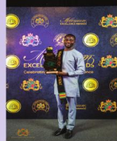
MANASSEH AZURE (MEDIA PERSONALITY)