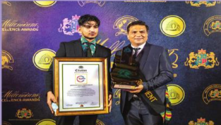
BS PLUS LIMITED (CORPORATE SOCIAL RESPONSIBILITY)