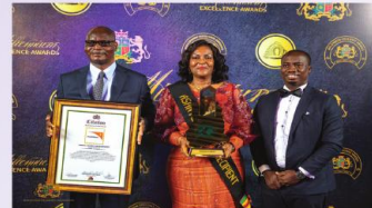
WORLD VISION (EXCELLENCE IN RURAL & URBAN DEVELOPMENT)