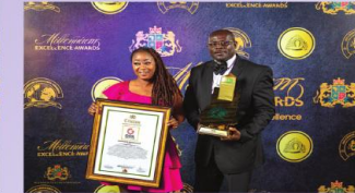
GOIL ENERGY GHANA (CORPORATE GOVERNANCE)