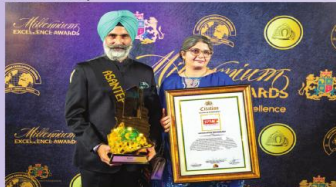
IPMC I.T TRAINING ( INFORMATION TECHNOLOGY)