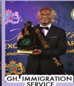
GH. IMMIGRATION SERVICE (EXCELLENCE IN GOVERNANCE & SECURITY)