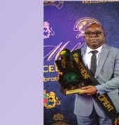
MINISTRY OF DEFENCE (EXCELLENCE IN GOVERNANCE & SECURITY)