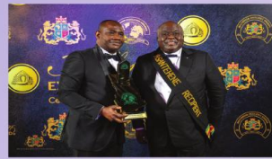
GCB BANK LIMITED (FINANCIAL BUSINESS OF THE DECADE)