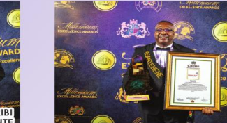
GHANA NATIONAL GAS COMPANY (OIL & GAS)