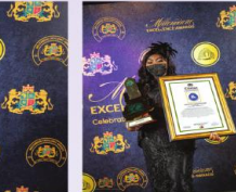
ZOOMLION (SANITATION / INFRASTRUCTRE)