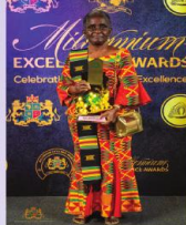
AJOA YEBOAH AFARI (MEDIA PERSONALITY (WOMEN))