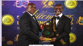
DARKO FARM (EXCELLENCE IN AGRICULTURE & FOOD SUSTAINABILITY)