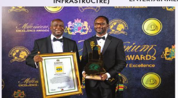
MTN (BUSINESS OF THE DECADE)