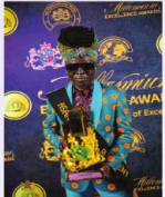
KOJO ANTWI (EXCELLENCE IN MUSIC & ENTERTAINMENT)